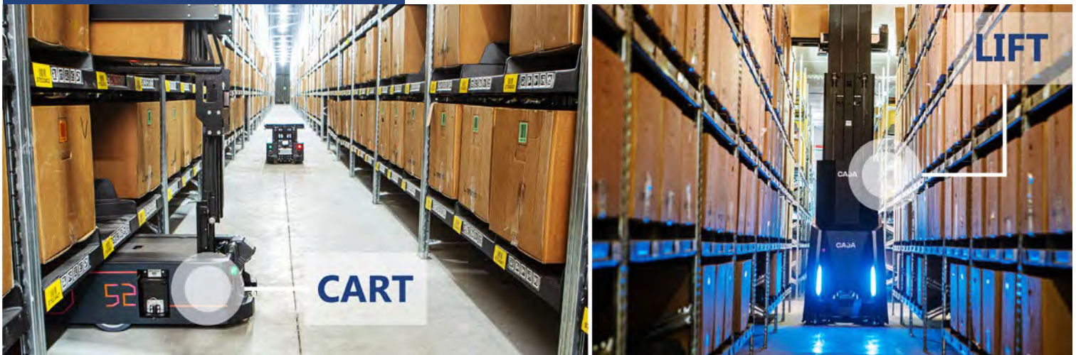
FIGURE 5, CAJA ROBOTIC SYSTEM

Caja Robotics ' two types of specialized robots work synergistically to optimize the goods-to-person system. As the Lift robot can reach high and the Cart robot can move fast, each of them is assigned suitable tasks to constantly move bins between workstations and shelves.