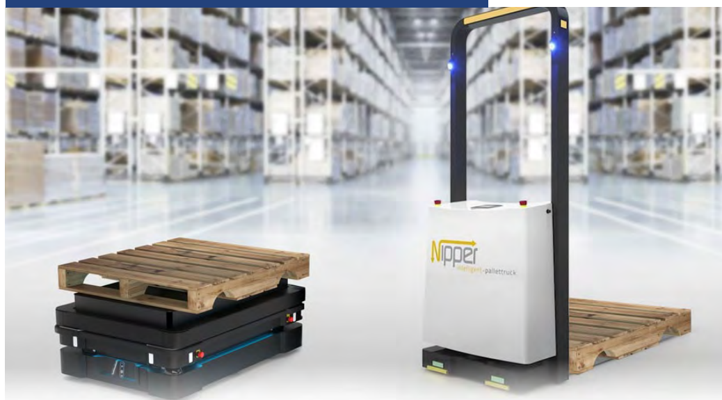
FIGURE 3, AMRS FOR PALLET TRANSPORT

Autonomous Mobile Robots (AMR) are self-driving collaborative vehicles that navigate around people and objects without the need of a track. The flexibility of AMRs is endless. Interchangeable top modules allow for materials of different shapes and sizes. By using AMRs for automated pallet transport, employees' time can be repurposed from point-to-point transportation to focus on more value-added operations.